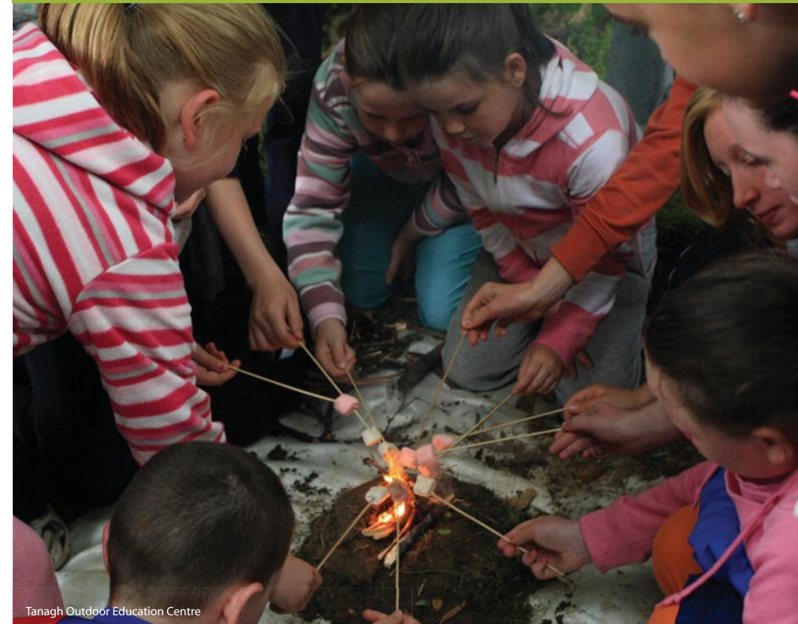
Tanagh Outdoor Education Centre